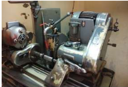
Fig 2:- Grinding operation on work piece