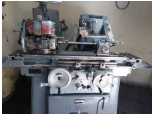
Fig 1:-Grinding Machine Used for experiment

This present paper, effort is made to optimize the grinding process parameter for minimum surface roughness and maximum MRR and to find mathematical correlation between two or more variables. Experiments were conducted at various level of grinding parameter such as depth of cut, feed rate, spindle speed and hardness of material. The ranges of the parameters for the investigation were determined from preliminary experiments. Each parameter was investigated at three different levels in order to show the efficacy of the parameters at optimum level of the parameters. Taguchi method based L9 orthogonal array was selected and experiments were conducted as per experiment layout plan. In the present work, experimental results were used to find mathematical correlation in the form of non-linear, linear, linear with interaction, linear with square, Quadratic model. These models are developed in response by considering selected grinding parameter. Finally the predicted value are validated and compared with experimental values.